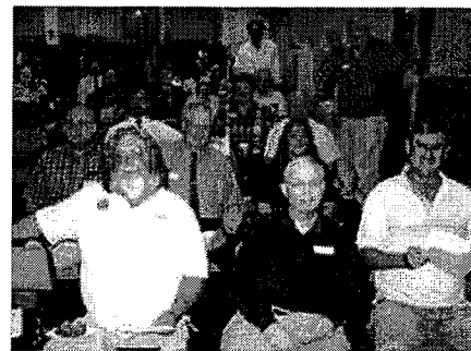
Veterans' 2006 Annual Meeting

In addition to direct services, the county Veterans' Program has revised its program design and client flow, develop policies and procedures, and created a training curriculum for new staff. The program has developed outcomes and indicators to measure the success of the newly-enhanced program services; for example, decreasing the immediate financial crisis of the veteran, decreasing the numbers of homeless veterans, and increasing the number of veterans who are successful with employment. The Veterans Program is also implementing ways to increase geographic access to its programs.