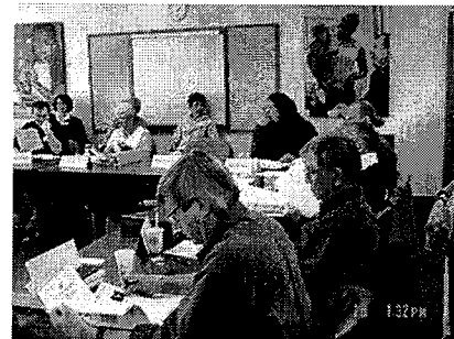
Veterans Levy Board members discuss procurement plans.

Timeline. The lifespan of the levy is January 2006 through December 2011, with a request for renewal to go before the voters in late 2011. The levy directs that the evaluation demonstrate the levy's value prior to the request to renew the levy. Therefore, the majority of the evaluation will take place over the next 50 months.